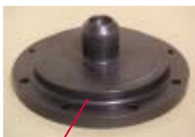
Base / Pedestal