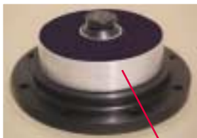
Restoring Force Insert