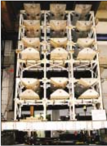
52.4 kip Six-story model used in the large scale shake table testing of the Axon Bearing

A new seismic damage prevention technology that is superior in performance and more cost effective to implement